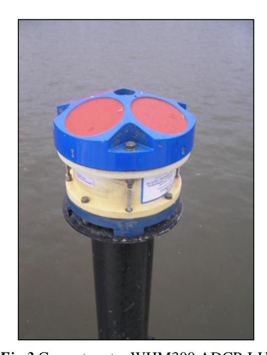
Fig.3 Current meter WHM300 ADCP-I-UG1