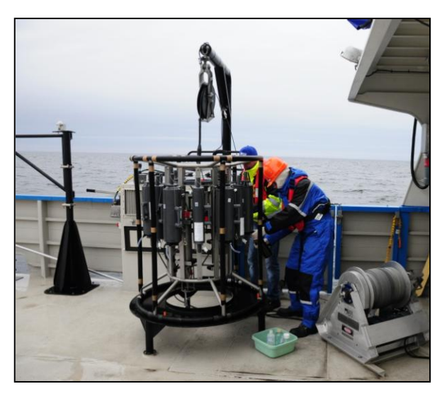
Fig. 2 Probe CTD 90

Probe CTD 90 was used during the cruise. Current meter WHM300 ADCP-I-UG1 was used to measure current speed and direction.